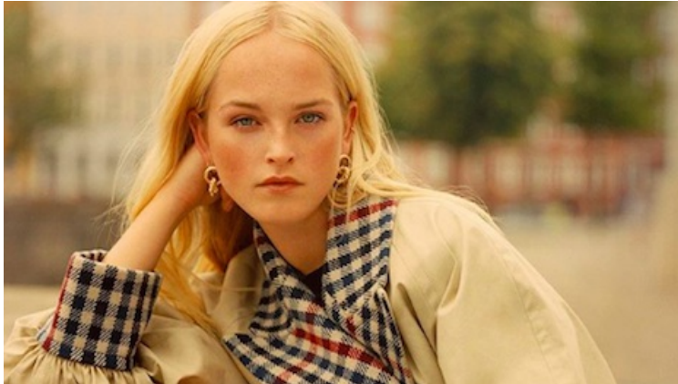
British model Jean Campbell modeling a fall-winter 2019 look from Porter Magazine's outwear special.